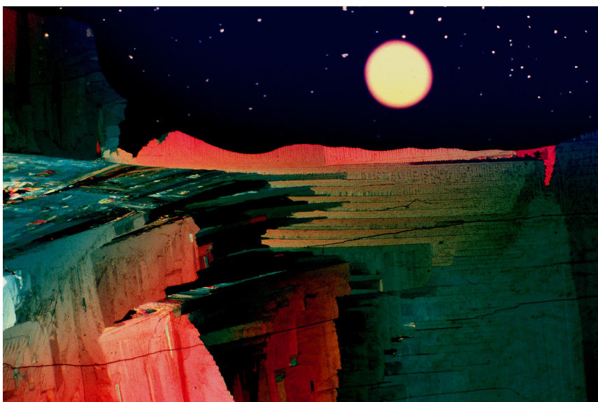
Figure 3. Sulfur Canyon A multiple (4) exposure of sulfur crystals (the canyon-like foreground), the field diaphragm defocused with a yellow filter in the light path (the moon), and liquid crystalline polybenzyl-L-glutamate spherulites (the stars) with a blue filter to simulate the sky.

tic than others. For instance, the snow-covered mountain effect illustrated in Figure 1 is obtained from a concentrated liquid crystalline solution of the polysaccharide xanthin gum in water. Other useful mountain backgrounds can be produced using crystals made from the organic buffer HEPES, from