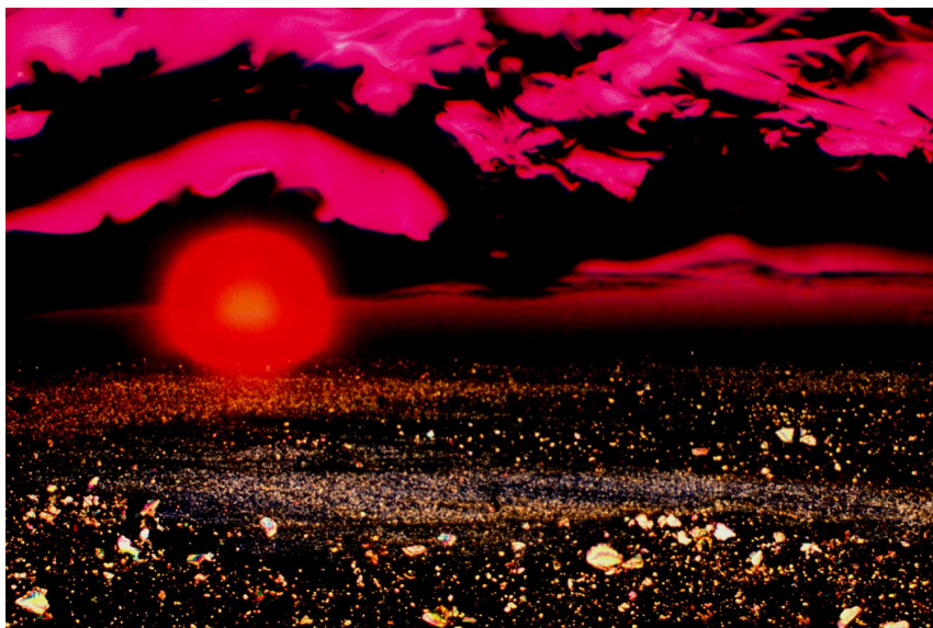
Figure 5. Nuclear Sunrise A multiple (3) exposure of ascorbic acid slowly crystallized from ethanolic solution and smeared across the microscope slide while drying (the sandy, rocky foreground), an epoxy resin bead with a 530 nm retardation plate inserted between the sample and the analyzer with a blue filter in the light path (the sky), and the field diaphragm defocused with a red filter (the rising sun).

If tungsten-balanced films are not to your liking or are unavailable, you can insert a Kodak 80A blue filter or its equivalent between the light source and first polarizer