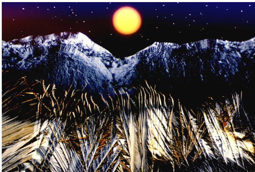
Figure 1. Ascorbic Acid, Idaho. A multiple (5) exposure of ascorbic acid (the wheat field in the foreground), liquid crystalline xanthin gum (the mountains), the field diaphragm defocused with an orange filter (the moon), and polybenzyl-L-glutamate spherulites (the stars) with a blue filter.

Employing an assortment of classical and non-classical microscopy techniques, I have succeeded in assembling a series of photomicrographs designed to resemble unusual and/or alien landscapes, which will be referred to as “ microscapes .” The basic construction of these photomicrographs involves the classical microscopy techniques of brightfield and cross-polarized illumination, assisted by basic visible light color-filtering processes. Microscapes consist of multiple exposures (so far from 2 to 9) fashioned on a single frame of 35mm transparency film.