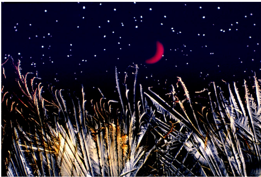
Figure 4. The Stand A multiple (4) exposure of melt-recrystallized ascorbic acid (the wheatfield), the field diaphragm defocused with a yellow filter and a ball point pin inserted into the light path (the moon), and liquid crystalline polybenzyl-l-glutamate spherulites (the stars) with a blue filter to simulate the sky.

is accomplished by closing the field diaphragm of the microscope until the desired sun or moon diameter is reached. Next, the image of the shutter leaves is defocused until they merge to form a complete circle. After placing the appropriate filter (usually orange, yellow, or red) in the light path, the image of the field diaphragm can be relocated to any position in the view field simply by adjusting the centering thumbscrews on the substage condenser. Placing a mask over the bottom portion of the image will create a rising sun effect as illustrated in Figures 2 and 5. With a yellow or orange filter, the exposure time length determines the outcome of color distribution. Very short exposures produce images with a reddish perimeter and a saturated yellowish interior (Figure 1, for instance) while longer exposure times tend to wash out the image to yield more of a moon-like effect shown in Figure 3. Long exposure times when using a red filter will cause a yellowish center (Figure 5), while shorter times result in an even color effect (not shown).